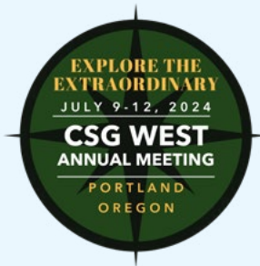
CSG West Annual Meeting July 9-12, 2024 | Portland, Oregon

The CSG regional meetings are events convened each summer by the CSG regional offices — CSG East, CSG Midwest, CSG South and CSG West. Each event is unique to its region and brings together state policymakers of all levels and branches — from those just finishing their freshman session to Senate presidents and speakers of the House. Each meeting hosts between 500 and 1,000 attendees, depending on the regional location, and the programs feature strong host state pride, enriching public policy discussions and leadership development trainings.