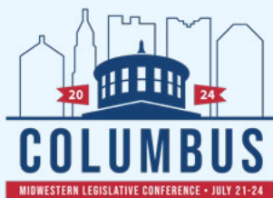
CSG Midwestern Legislative Conference Annual Meeting July 21-24, 2024 | Columbus, Ohio