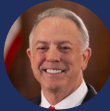
NATIONAL PRESIDENT Gov. Joe Lombardo Nevada