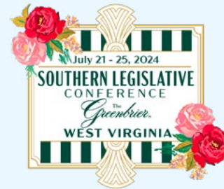
CSG Southern Legislative Conference Annual Meeting July 21-25, 2024 | The Greenbrier, West Virginia