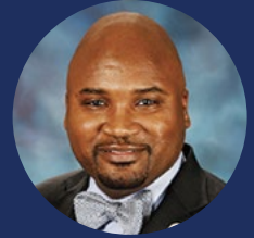
NATIONAL CHAIR-ELECT Sen. Elgie Sims Illinois